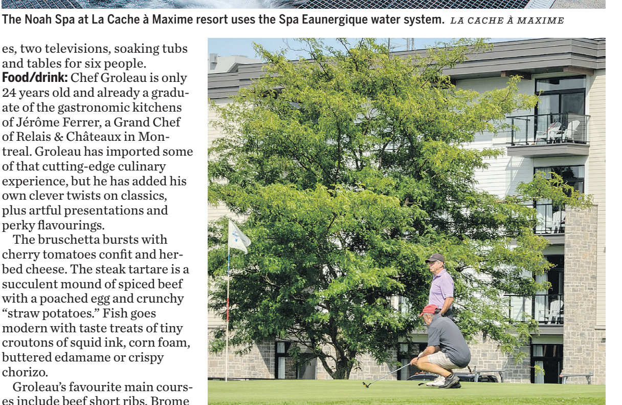
Golf is outside the door at the new La Cache du Lac Champlain in Veniseen-Québec.